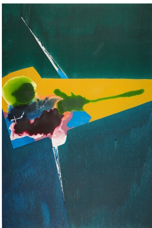
Untitled, 1975 Acrylic on canvas