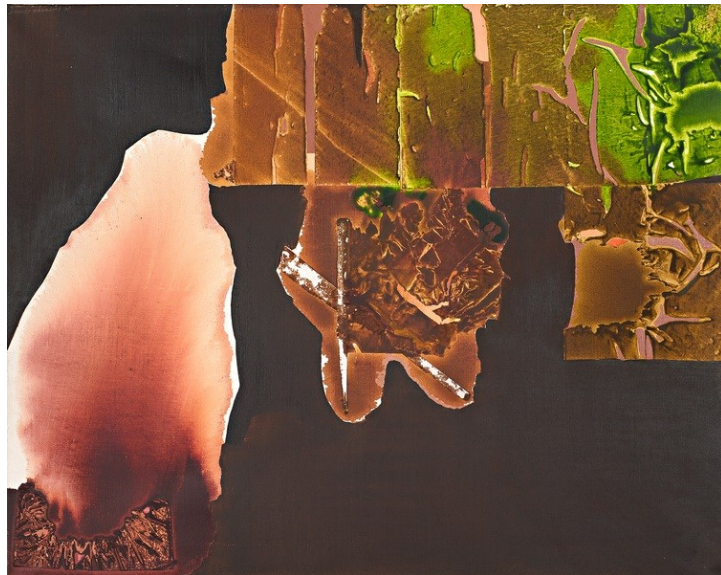
Untitled, 1975 Oil on canvas