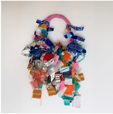
Linda Bell, Hoop Sculpture No. 43 , 2025 Mixed media 89 × 40 × 19 cm