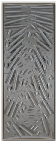
Marie Gyger, Party III , 2022 Silver kraft paper 185 × 71 cm 186 × 71 cm framed