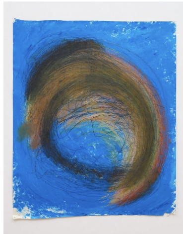
Nnena Kalu, Blue Vortex 8 , 2019 Acrylic, oil pastel and pencil on paper 124 × 101.5 cm Framed with museum glass