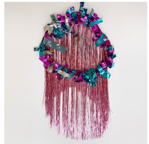
Linda Bell, Hoop Sculpture No. 31 , 2025 Mixed media 95 × 45 × 8 cm