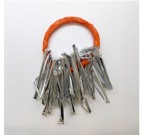
Linda Bell, Hoop Sculpture No. 13 , 2025 Mixed Media 57 × 41 × 19 cm