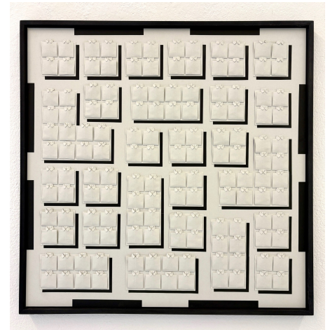
Marie Gyger, Open Space (Milieu) , 2024 Origami paper, Lettura 60 paper 60 × 60 cm