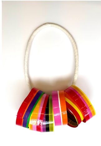
Linda Bell, Hoop Sculpture No. 7 , 2025 Mixed media 64 × 36 × 15 cm