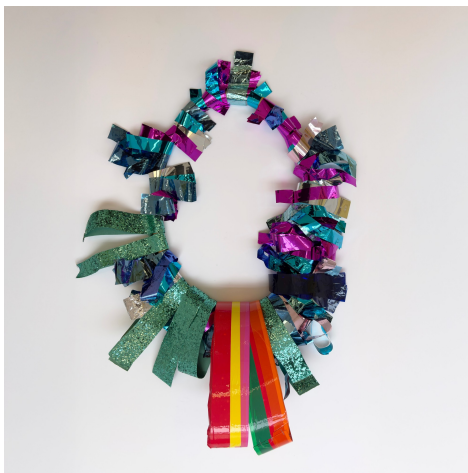
Linda Bell, Hoop Sculpture No. 24 , 2025 Mixed media 70 × 59 × 13 cm